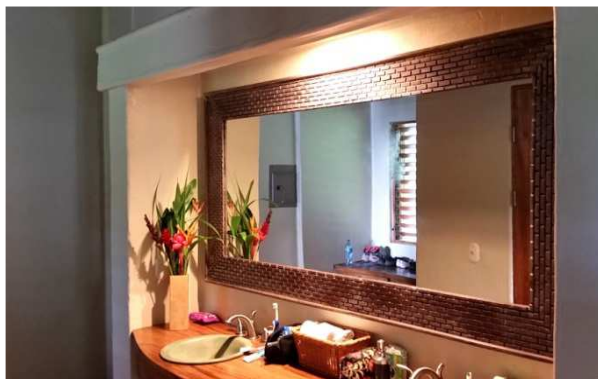
One of two master baths with dual sinks