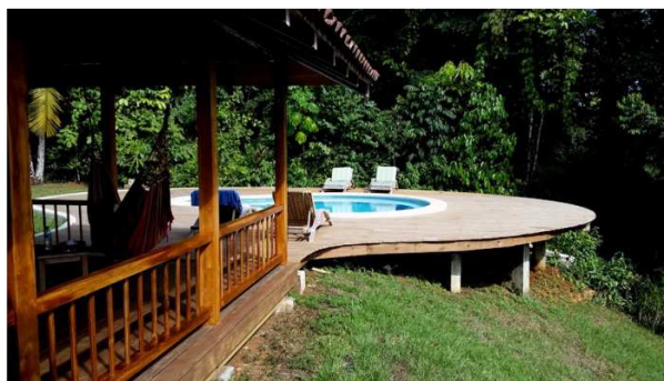
Private pool and deck