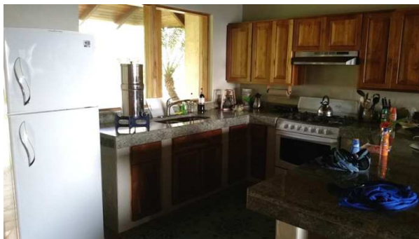
The fully furnished kitchen