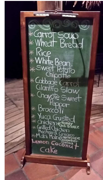
There are specials every night, not a fixed menu.

All of this said, my wife likes to cook and we reserved Casa Coco (with a fully furnished kitchen) so we bought food and supplies at the B&M market in Puerto Jimenez and she cooked two dinners for us. Casa Coco is a great option for a family or group, and you can buy everything you need at the B&M if you want a private dinner.