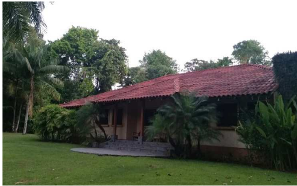
Casa Coco from the front