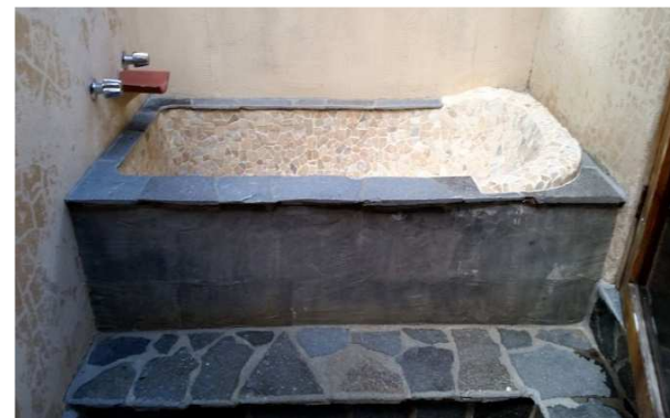
Stone lined master bathtub